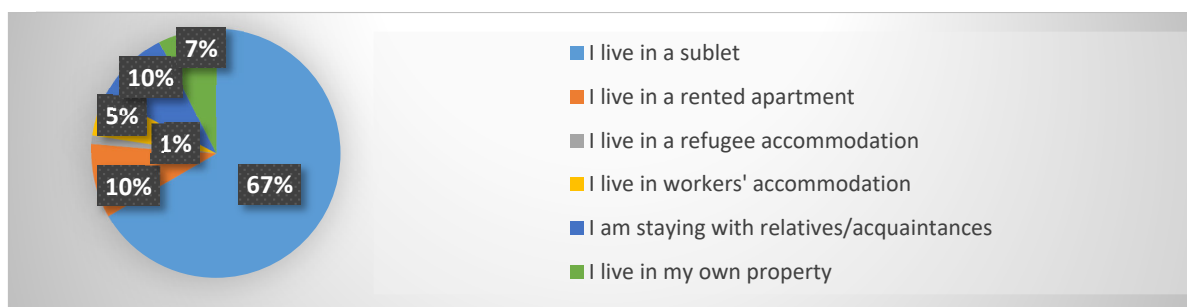
Figure 2. Housing conditions

Examining the housing situation of those who relocated after the war, it is noticeable that 67% of them have their own rented apartments, while the remaining third is divided among various options such as shared accommodations, refugee housing, workers' dormitories, staying with relatives, or owning their own property.